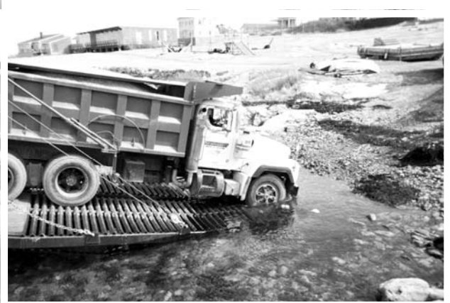
The landing craft transports trucks full of building supplies to and from the island (left). Sometimes just getting supplies to the island is quite a challenge (right)