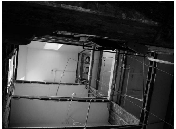
The new five story fire escape in Oceanic will run from the ground floor (Pel Hall) to the fourth floor—staff photo

Oceanic Fire Escape – An internal staircase is being constructed behind the Snack Bar, from the ground floor (in Pel Hall) to the top of the hotel.