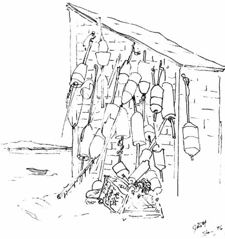
Illustration courtesy Joyce Homan.