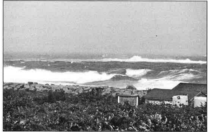
Hurricane Irene versus Star Island.