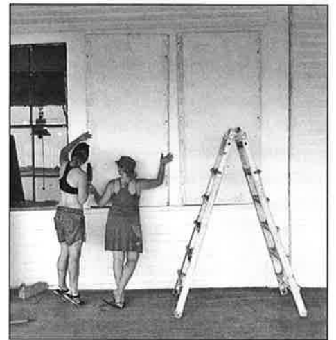
Pels board up the windows of the Oceanic Hotel in preparation of Irene.

of the outfall lines below the main pump station being ripped from its moorings by the waves and surge. It was easily repositioned when the seas went down. Monday saw the return of much of the crew and a rapid reversal of the close-down process. The Island was back to normal and ready for business by Tuesday. Those of us who were privileged to remain on Star for the show were reminded of the awesome power present even in a downgraded storm such as Irene, and the isolated and exposed nature of our facility.