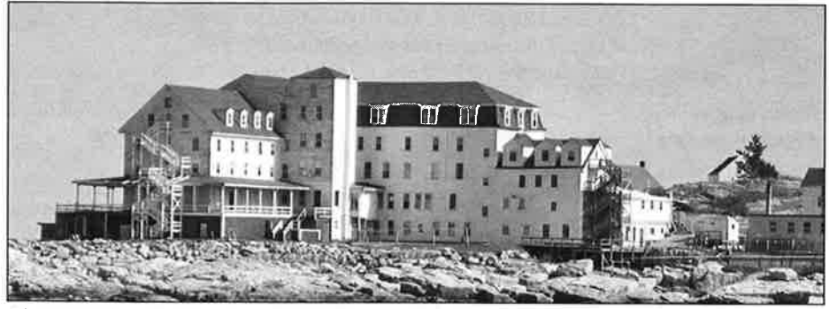
The new red roof on the Oceanic Hotel was paid for using your contributions to the Shining the Star campaign. Thank you!

And only on Star would a bathroom be a new tour highlight. The second floor bathroom of the Oceanic is a gem of a renovation that sets a new standard for capital projects. The new floors in the Founders units even inspired a group of All Star 1 volunteers to purchase the supplies and donate the labor to expand the Founders deck. And a restricted gift supported the creation of a new Memorial Courtyard, an area located behind Marshman and reclaimed from a former stone-surrounded garden or animal pen. A more complete update of campaign progress